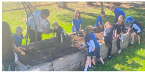
Weeding and preparing the soil in our vegetable garden.

Planting seedlings with our visitors from Bunnings.