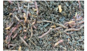
Making our own worm farm. Here are our worms!