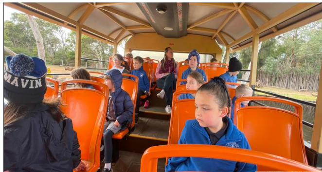
Our visit to the zoo and riding the Safari bus.